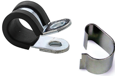
FIGURE 3: SENSOR MOUNTING CLAMP AND CLIP