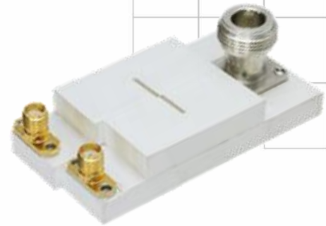
Part Dimensions: 74.5 × 33.5 × 14.5 mm • <145 g Materials: Ag plated ceramic block