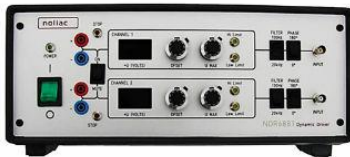
NDR6881 Dual Channel Dynamic Driver NDR6881-20A Dual Channel Dynamic Driver

Learn more about the different piezoelectric drivers on www.ctscorp.com .