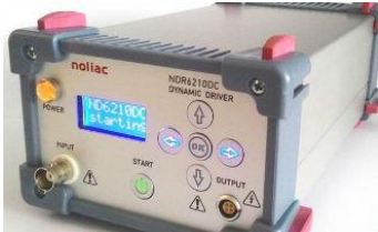
NDR6210 Single Channel Dynamic Driver NDR6220 Single Channel Dynamic Driver