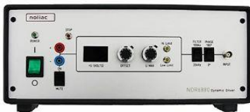
NDR6880 Single Channel Dynamic Driver NDR6880-20A Single Channel Dynamic Driver