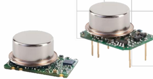
Dimensions: 21.6 x 15.3 x 9.5 mm